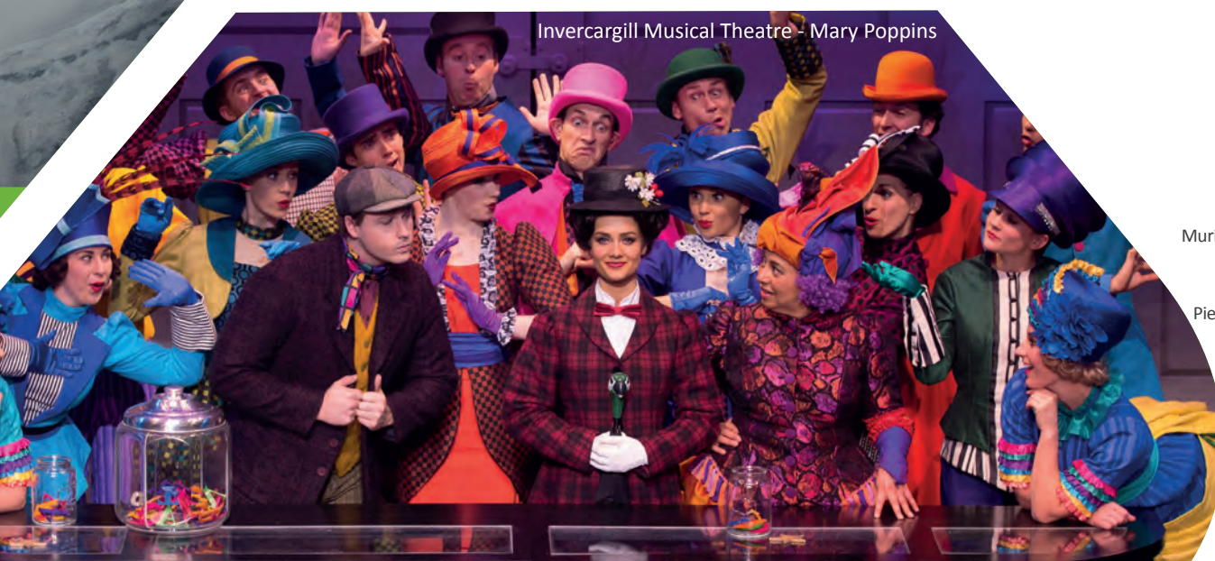
Invercargill Musical Theatre - Mary Poppins