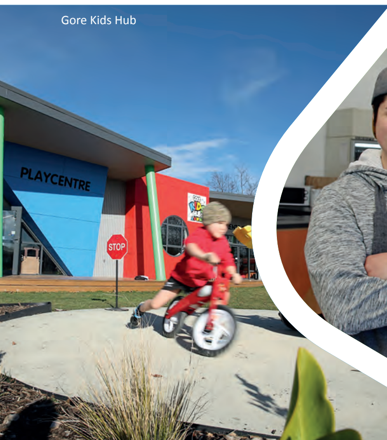
Gore Kids Hub