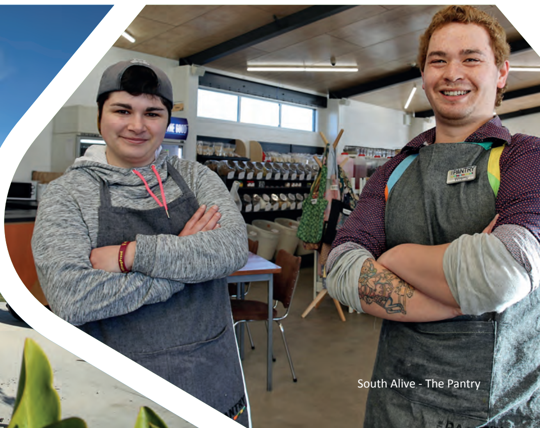
South Alive - The Pantry