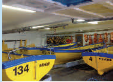
Te Ara o Kiwa Sea Scouts New fibreglass yacht