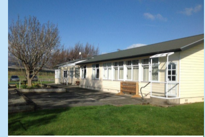
Blackmount Community Pool Soc Purchasing land & school building