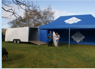
Southland Board Riders Assn Mobile clubroom