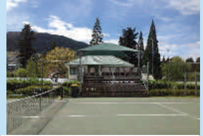
Queenstown Tennis Club Resurfacing Courts