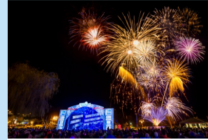
Destination Queenstown Queenstown Winter Festival