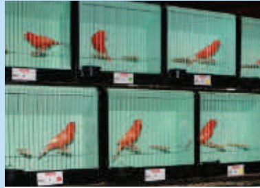
Southland Bird Club 2014 National Bird Show