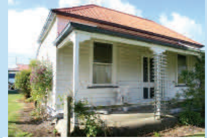
Southland Heritage Building Preservation Trust - Kohi Kohi Cottage Restoration