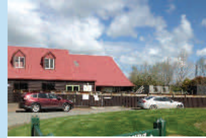
Heriot Playcentre Replacing boundary fence